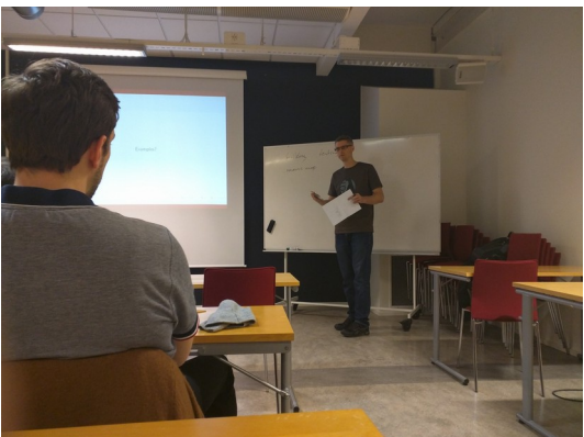
Some photos from earlier foss-gbg events hosted at Lindholmen, Ekelundsgatan and GU/Chalmers.